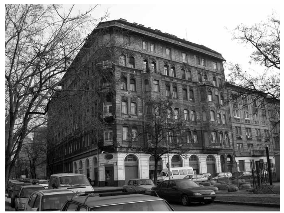
Budapest, Building in rehabilitation.

currency, the Forint (HUF), was depreciated at the onset of the financial crisis<sup>6</sup>, these debts and their interest rates, calculated in the foreign currencies, suddenly increased. In 2010, the debt's value had exceeded the habitat's value, as it had been calculated for the amount of the loan, for 25% of them<sup>7</sup>. Still according to the National Bank's report, in 2010, 90,000 households were in a situation of "problematic mortgages", meaning that they had not been able to pay their monthly instalments for over three months<sup>8</sup>. The moratorium on evictions established by the government in 2010 was lifted in July 2011. Since then, the number of properties put up for auction has considerably increased, to the point that there can now be a several-year delay in starting the procedure. The government measures to alleviate the situation only concern relatively wealthy households<sup>9</sup>. The government policies for indebted households focus exclusively on mortgages. By doing so, they fail to account for the other kinds of debts which affect an even larger number of households: those who have difficulties paying for their expenses or their rent. However, these hardships are more and more common in Hungary, at almost all levels of society. For instance, a TIGAZ