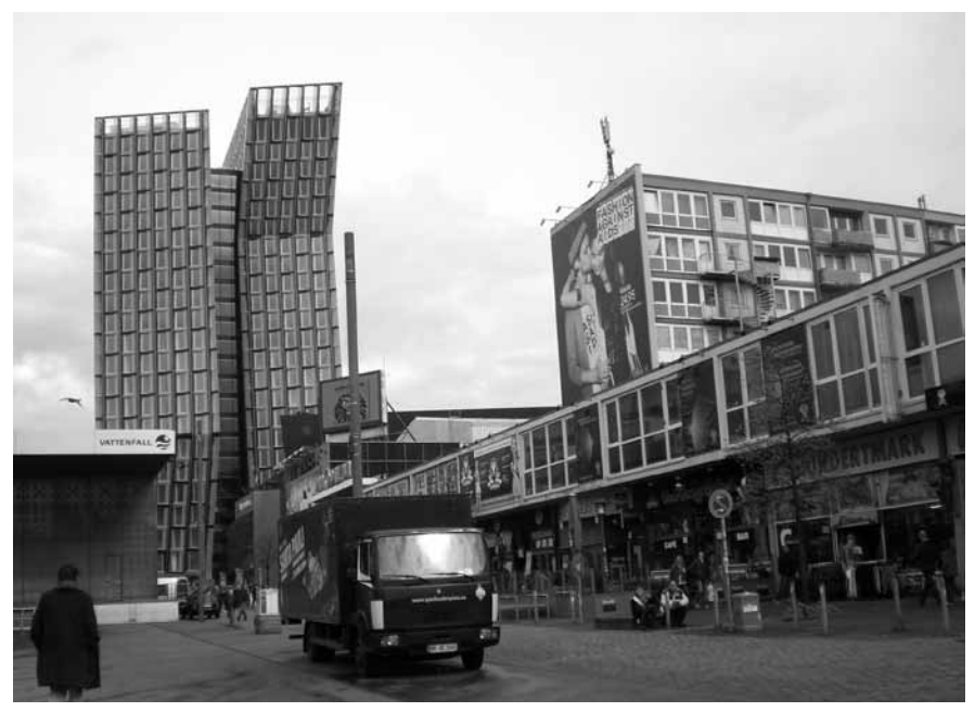
San Pauli, a changing district. April 2012

Starting in 2009, new forms of protest began to appear. In San Pauli , inhabitants now wear T-shirts of the local football team but at the same time express their outrage in the face of soaring rents and luxury real estate projects, restaurants and hotels altering the working class characteristics of the district and turning it into a tourist attraction. Illustration San Pauli. The movement is defined and framed by the interactions between activists and researchers in urban sociology: it is a struggle against gentrification<sup>4</sup>. Thanks to ironic slogans like " It's raining caviar ", or the documentary film " Empire San Pauli ", screened during different events, the public opinion and the media's attention have been drawn to these opposition movements which seek to shed light on the urban development process and its negative effects on the existing social structures.