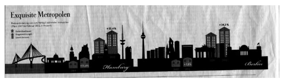
Delightful cities: price variations for the purchase of existing housing (in percentage, from March 2007 to February 2012), single family houses and apartments". Graph published in the article in Zeit n°16 "Hamburger Preissprünge" on April 22nd, 2012, p. 22.

did not seem concerned by the global real estate crisis. This property bubble can be explained by particularly low interest rates, matching the European averages as defined by the European Central Bank for all the European countries, for Germany as well as for Italy or Spain. Therefore, people have been investing in Hamburg, getting loans, the prices have been increasing and the new office buildings remain empty. Property speculation has been bolstered by the Senate's policies<sup>2</sup>, which are aimed at defining a new identity for this formerly industrial port, casting it as a growth-oriented metropolis. The "Hafen-City" project is a new 157-hectare district with offices, shops, housing and a classical music concert hall. It is the biggest urban development construction project in Europe<sup>3</sup>. Located on the city's waterfront, it is aimed at attracting very wealthy residents. Moreover, the 2012 Hamburg IBA (Internationale Bauausstellung = international architecture exhibit) has led to a complete renewal of districts such as Wilhelmsburg, an island located south of the city centre, between the north and south branches of the Elba. Hamburg has traditionally been viewed as an open-minded city, but it is becoming the most expensive city in Germany. But all of Hamburg's inhabitants haven't become richer thanks to the soaring property prices. What space and role does this economic development leave for the middle and working classes?