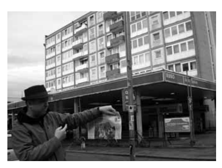
A member of the San Pauli archives organisation showing an article about the families' mobilisation in front of the ESSO building scheduled to be demolished. Photo: Elodie Vittu, April 2012

actors in cities, ecological issues and rental housing vacancies are also called into question. One of the major negative effects of gentrification is the use of the image of the artist to increase the attractiveness of neighbourhoods. A theoretical observation shows that a neighbourhood is at a risk of gentrification if: A/ it is within walk-